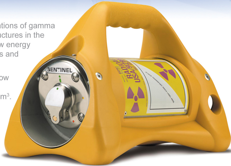
Comfortable carrying handle with slip-resistant contoured grip