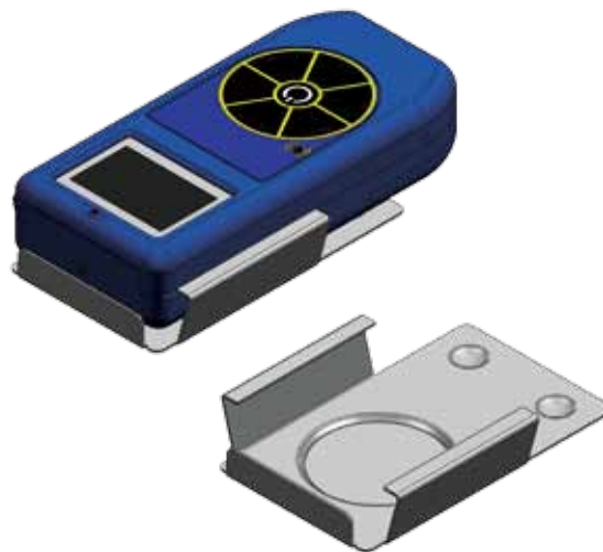
Wipe Test Plate