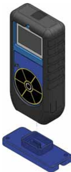
Ruggedized boot and Stand Included