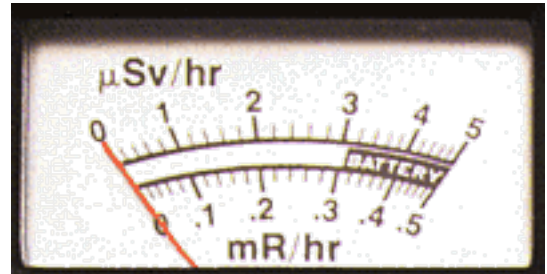
Optional SI Meter Scale: 0-500 µSv/hr & 0-50 mR/hr