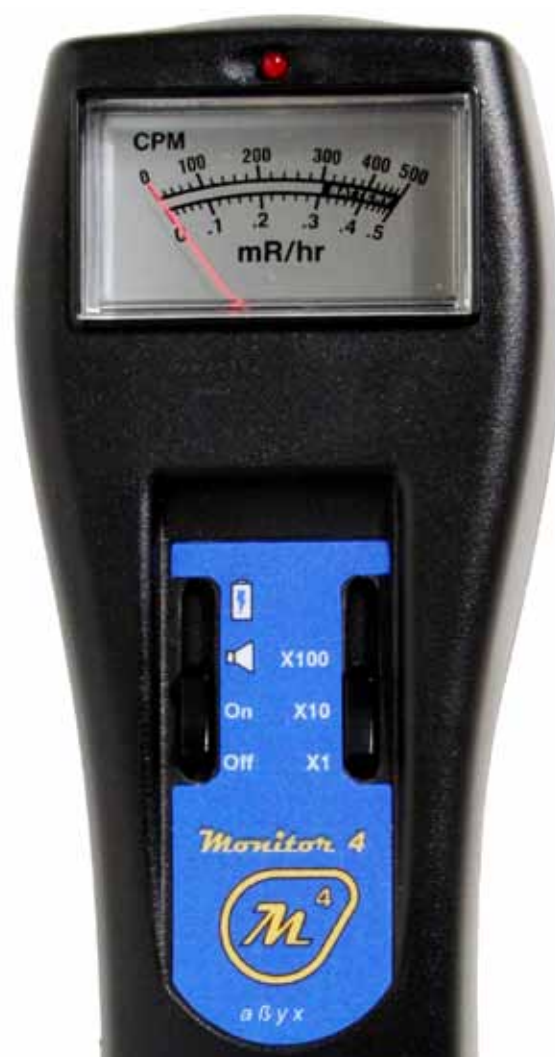
M4 with CPM & mR/hr meter scale

Analog Meter holds full scale in fields as high as 100X maximum reading. CPM & mR/hr scale. Optional SI Scale Meter Available