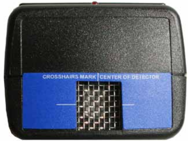
The end window of the M4 and M4EC

Headphone 3.5mm jack to count to computer or datalogger.